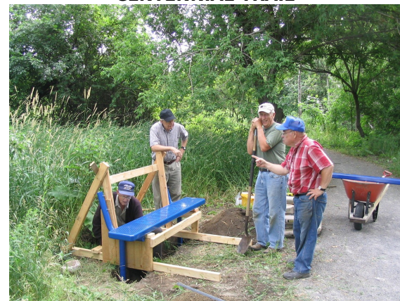
INSTALLING A BENCH ON THE TRAIL