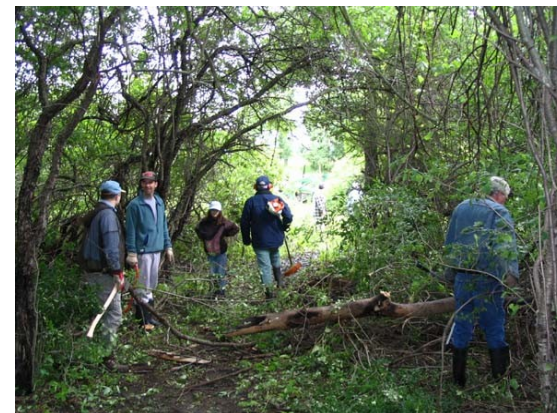
WORKING TOGETHER ON THE ROTARY CENTENNIAL TRAIL

Rotary's classification system ensures that a club's membership represents a variety of the community's professions and occupations, including retired people, from all walks of life.