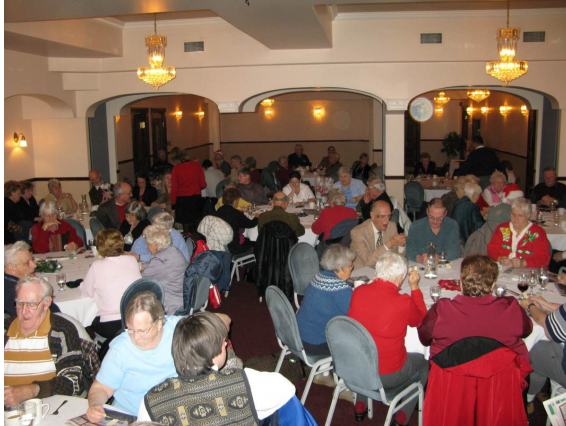
ROTARY SENIORS CHRISTMAS DINNER 2008